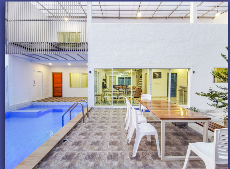
Thepprasit Cosy Twin A

We've been trusted since 2016, and here are the unique spaces we've lovingly built for you.