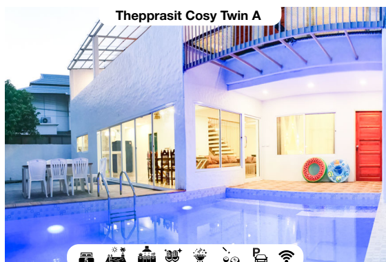
Theprasit Cosy Twin A